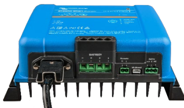
Phoenix Smart 12/50(3)