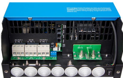
Connection Area MultiPlus-II 3k