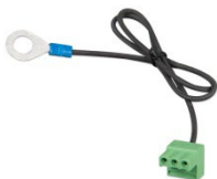
Connector with preassembled DC minus cable (included)