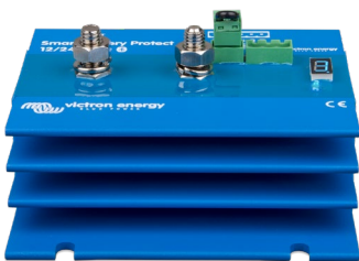
Smart BatteryProtect BP-220