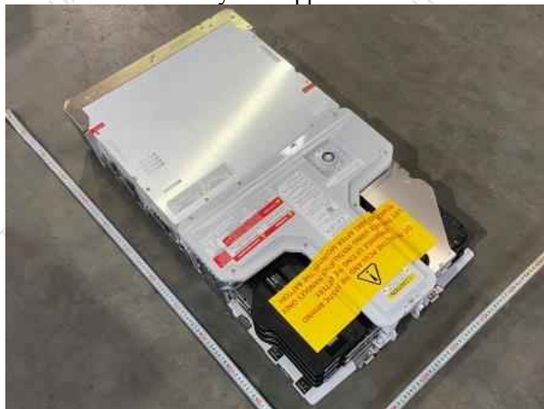
电池侧面外观 Battery side appearance