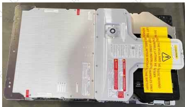
电池正面外观 Battery front appearance