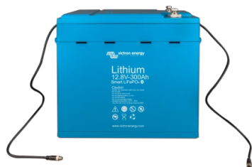
12,8V 300Ah LiFePO 4 Battery

Very useful to localize a (potential) problem, such as cell imbalance.