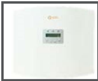
Front View EPM Plus 5G