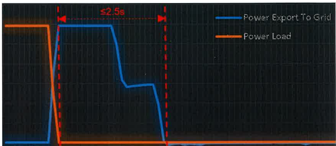
Figure 2. Control Result