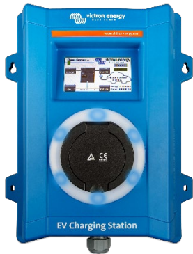
EV Charging Station