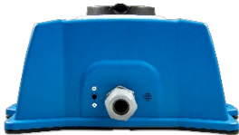
EV Charging Station - Back