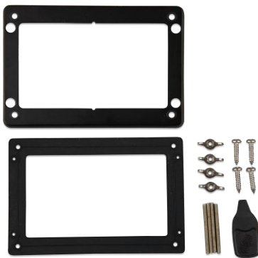
Accessories included with the GX Touch