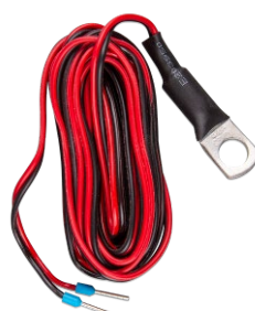
Temperature sensor for Quattro, MultiPlus and GX Device (such as the Cerbo GX)

This adapter is designed to easily replace the CCGX display with the newer GX Touch 50 or the GX Touch 70. Contents of the packaging are the metal bracket, the plastic bezel, and four mounting screws.