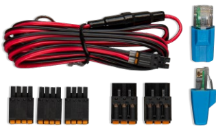
Accessories included with the Cerbo GX

The Cerbo GX is easily mountable and can also be mounted on a DIN-Rail using the DIN35 adapter small, (not included). Its separate touchscreen can be bolted on a dashboard, eliminating the need to create perfect cut-outs (like with the Color Control GX). Connection is easy via just one cable, taking away the hassle of having to bring many wires to the dashboard. The Bluetooth feature enables a quick connection and configuration via our VictronConnect app.