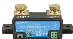
Bluetooth sensing: SmartShunt