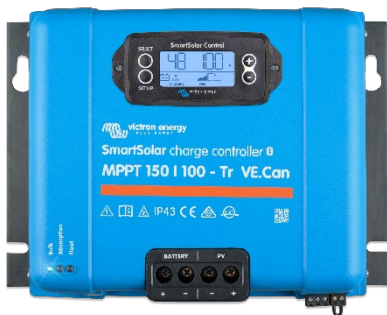
SmartSolar Charge Controller MPPT 150/100-Tr VE.Can with optional pluggable display