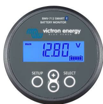
Bluetooth sensing: BMV-712 Smart Battery Monitor