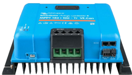
SmartSolar Charge Controller MPPT 150/100-Tr VE.Can without display