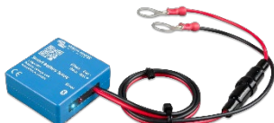
Bluetooth sensing: Smart Battery Sense