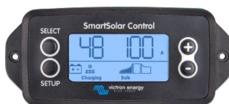
SmartSolar pluggable display

Simply remove the rubber seal that protects the plug on the front of the controller, and plug-in the display.