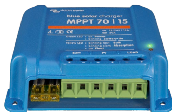
Solar Charge Controller MPPT 75/15