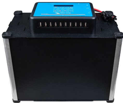
SHS 200 – mounted on optional battery box