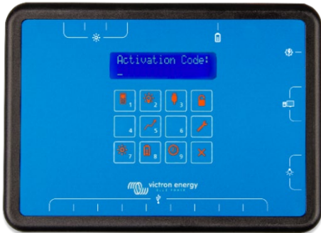
SHS 200 – Front view Keypad and LCD screen