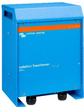
Isolation Transformer 3600W